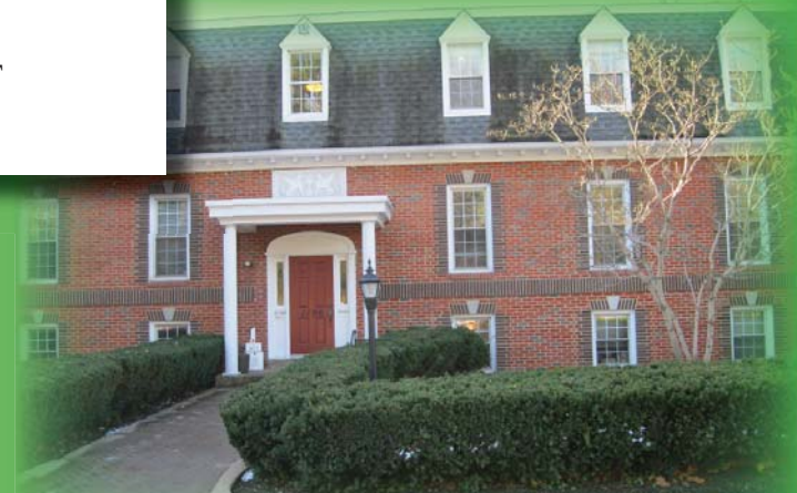
1106 Ohio River Boulevard: Our second Sewickley location where we currently rent space.